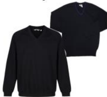
Plain Black Jumper V Neck or Round Neck (No Logos) or Branded school Jumper No hoodies