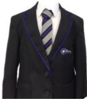
Academy Blazer (With or without purple piping) White Shirt Academy Tie (Striped or Plain Purple)