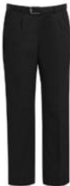
Black or Charcoal Trousers No Leggings or Jeans