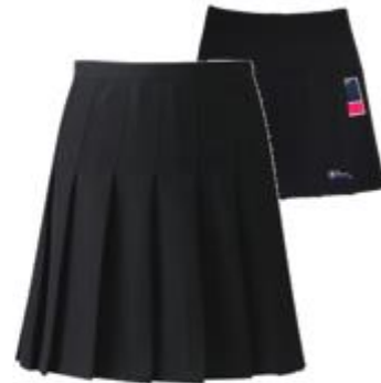
Black or Charcoal Box Pleated Skirt or Academy Skirt. No Pencil Skirts