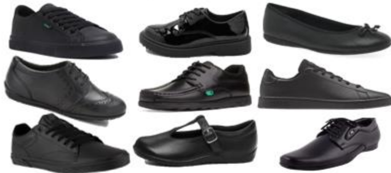
All Black Footwear. These should be Synthetic Leather or Leather to improve weather resistance.